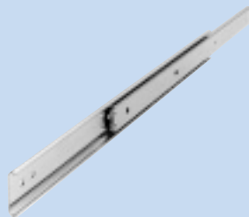
Models FBL 27S/35S

The basic unit type designed to have a stroke length approximately 70% of the overall rail length.