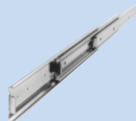
Model FBL 56H

A two-stage, high-load slide unit type with an even greater permissible load.